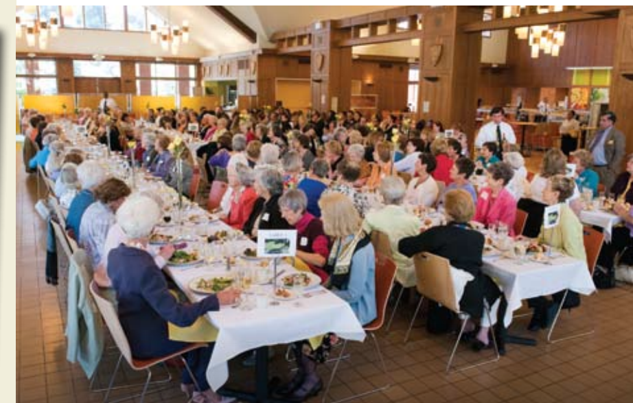
2010 Reunion Anniversary Luncheon.

For a list of hotels offering special rates during Reunion, please visit the alumni website at http://alumni.dominican.edu