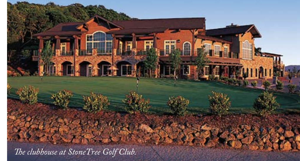
The clubhouse at StoneTree Golf Club.

Reception and Silent Auction | 5:00 p.m.