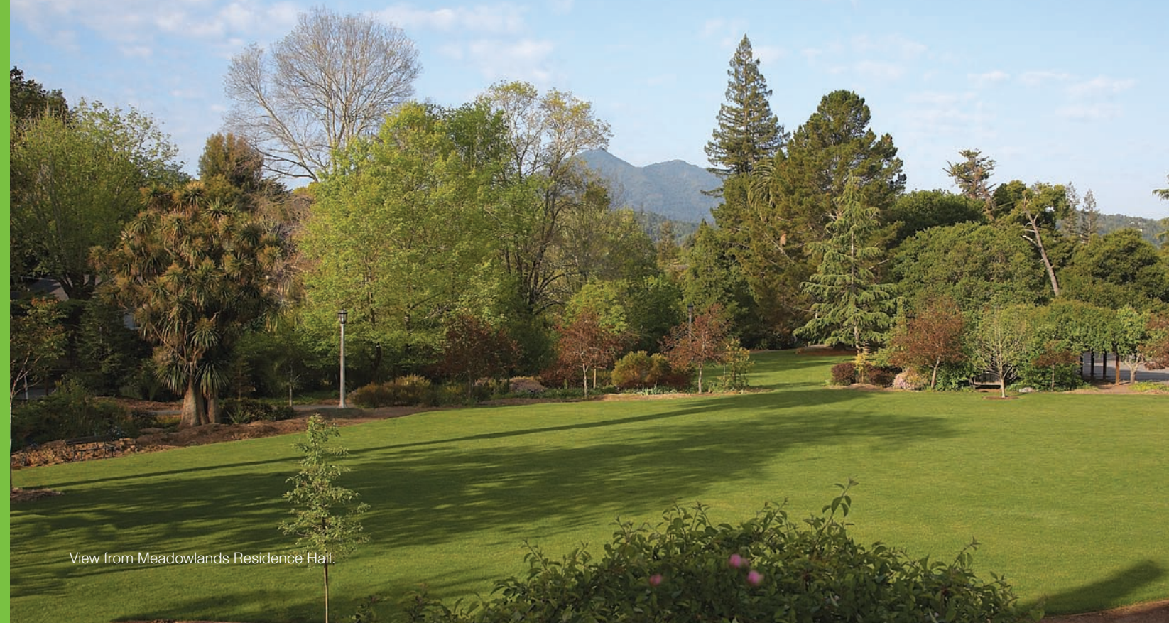
View from Meadowlands Residence Hall.